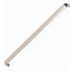
Camden 'D' 328mm Pewter / Code 103