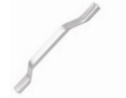
Soho Strap 160mm Brushed Nickel / Code 111