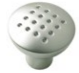
Dimple Knob Satin Chrome / Code 048