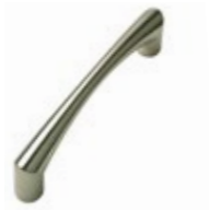
D' Handle 144mm Brushed Nickel / Code 002