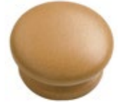
Beech Knob / Code 057