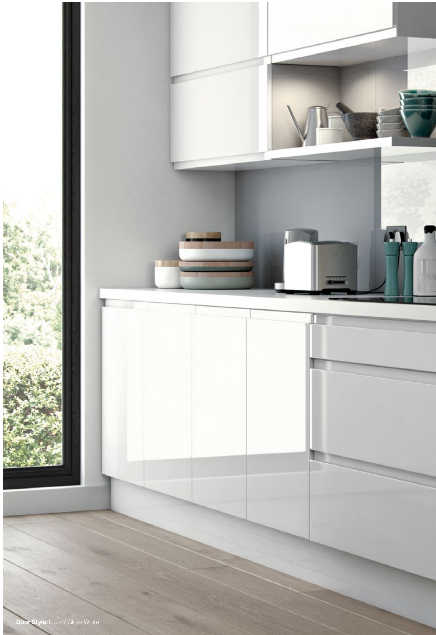
Door Style: Luzzi / Gloss White

High gloss, high impact. Choose a bold, sleek, modern finish to give your kitchen design the wow effect