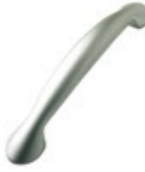
Roundel Satin Chrome / Code 019