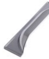
Modern Cup Chrome / Code 080