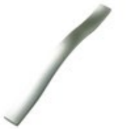
Strap Satin Chrome / Code 017