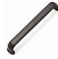
Bonn 'D' Handle Black / Code 114