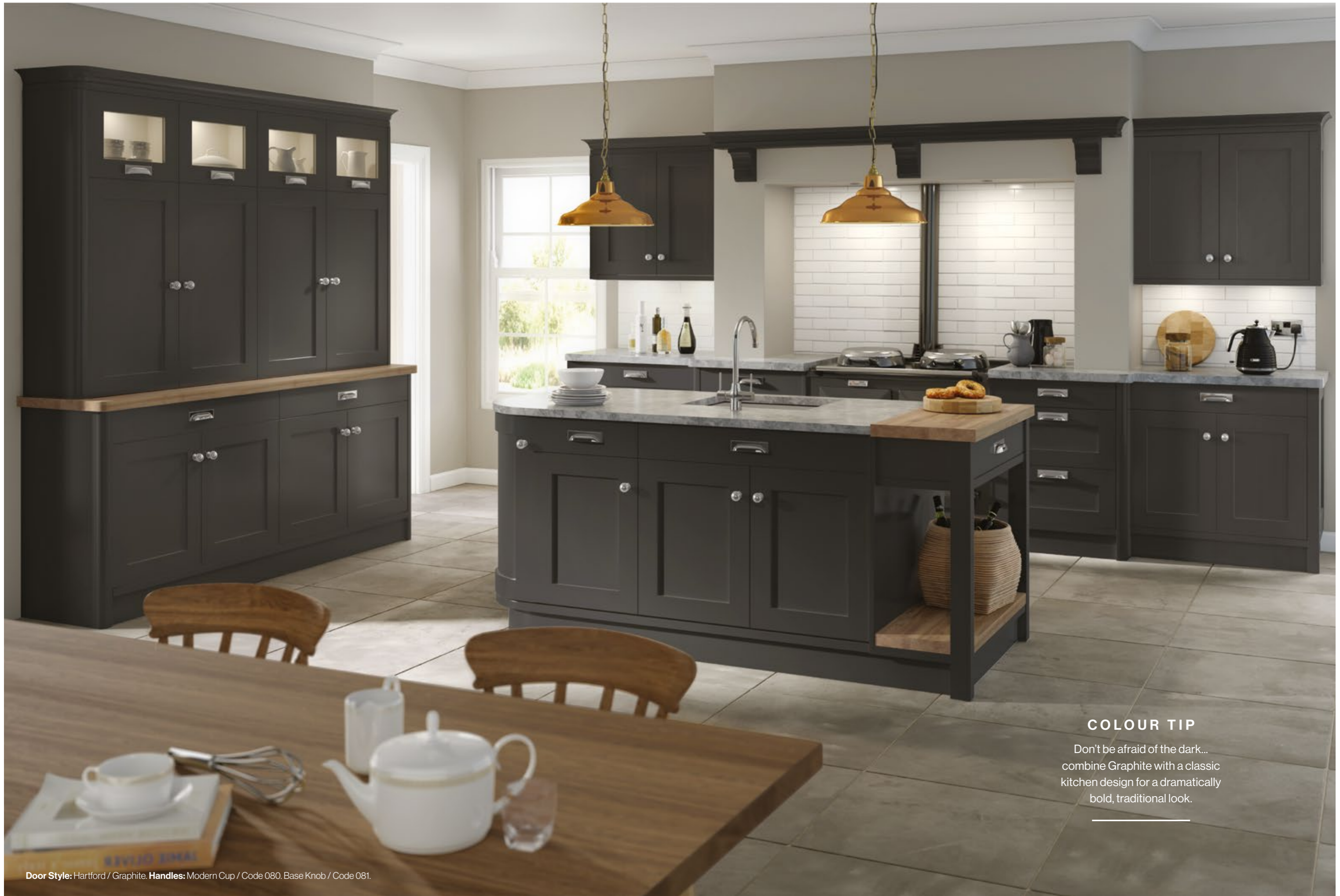
Door Style: Hartford / Graphite. Handles: Modern Cup / Code 080. Base Knob / Code 081.