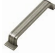
Cromwell Flat 'D' Pewter / Code 068