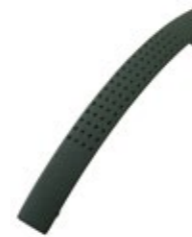
Dimple 'D' Handle Black / Code 040