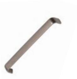
Camden 'D' 168mm Pewter / Code 107