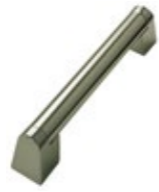
Angled Boss Bar Brushed Nickel / Code 011