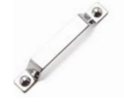
Essen 'D' Handle Chrome / Code 115