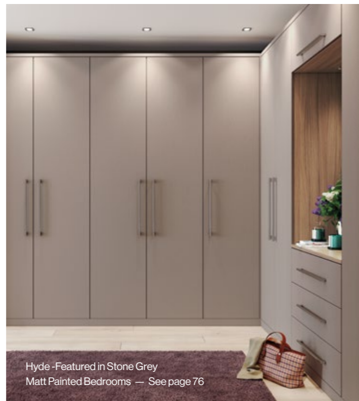
Hyde - Featured in Stone Grey Matt Painted Bedrooms — See page 76