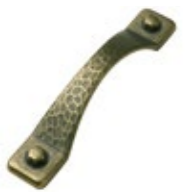
Hammered 'D' Handle Bronze / Code 037