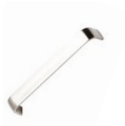
Camden 'D' 168mm Brushed Nickel / Code 105