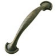
Half-Round Foot 'D' Bronze / Code 032