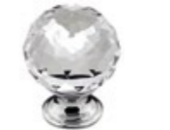
Clear Crystal Knob Chrome Base / Code 082