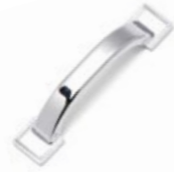
Windsor 'D' Handle Chrome / Code 095