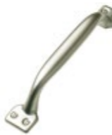
Shaker 'D' Handle Satin Chrome / Code 039