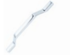
Soho Strap 160mm Chrome / Code 112