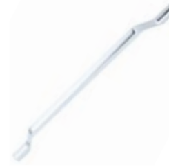
Soho Strap 320mm Chrome / Code 109