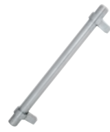
Collar Bar Brushed Nickel / Code 084