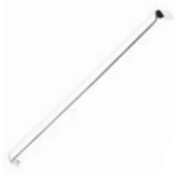
Camden 'D' 328mm Chrome / Code 102