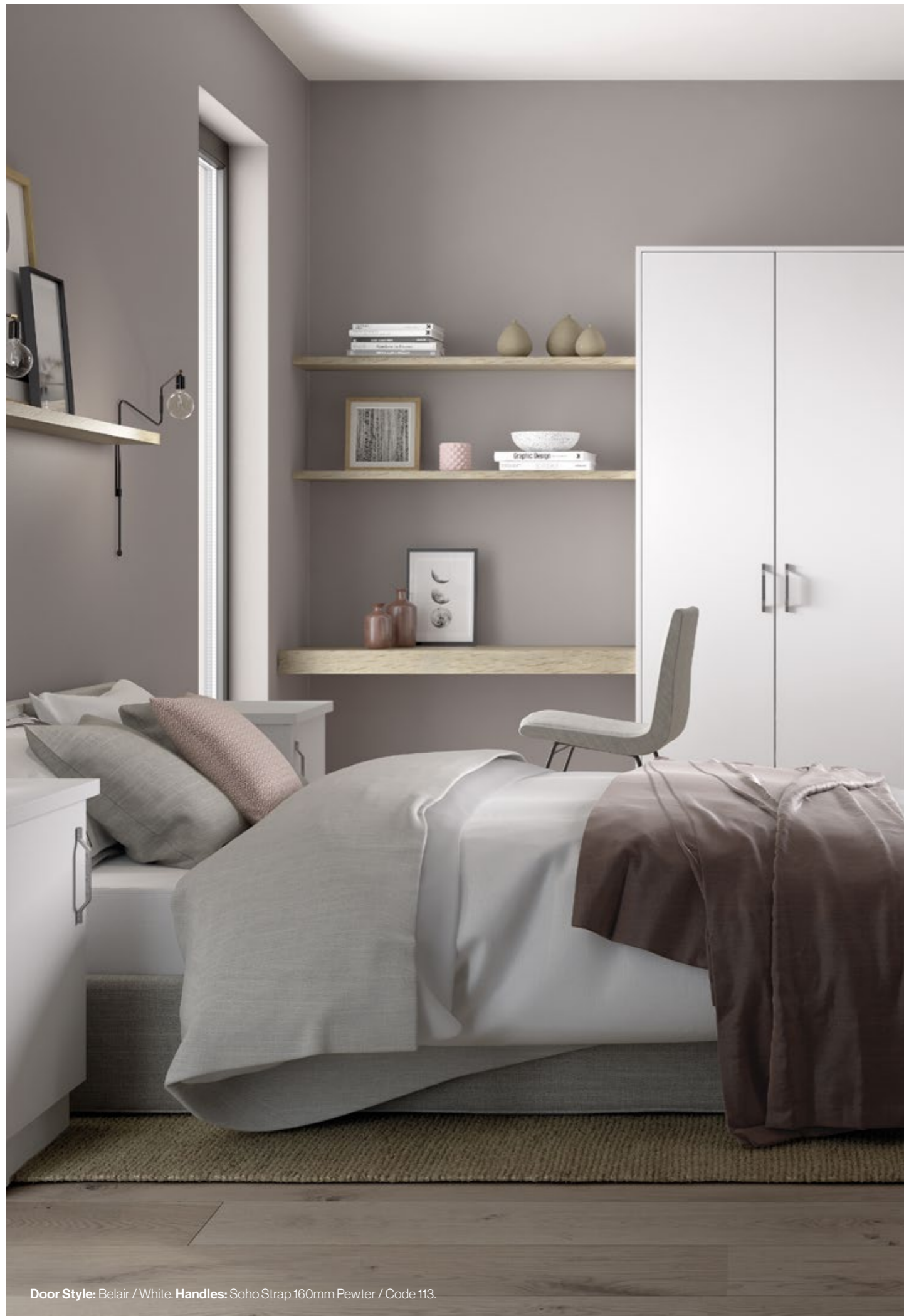
Door Style: Belair / White. Handles: Soho Strap 160mm Pewter / Code 113.

Whatever your style, you can sleep soundly in the Bedroom space you've always dreamed of.