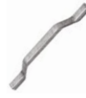
Soho Strap 160mm Pewter / Code 113