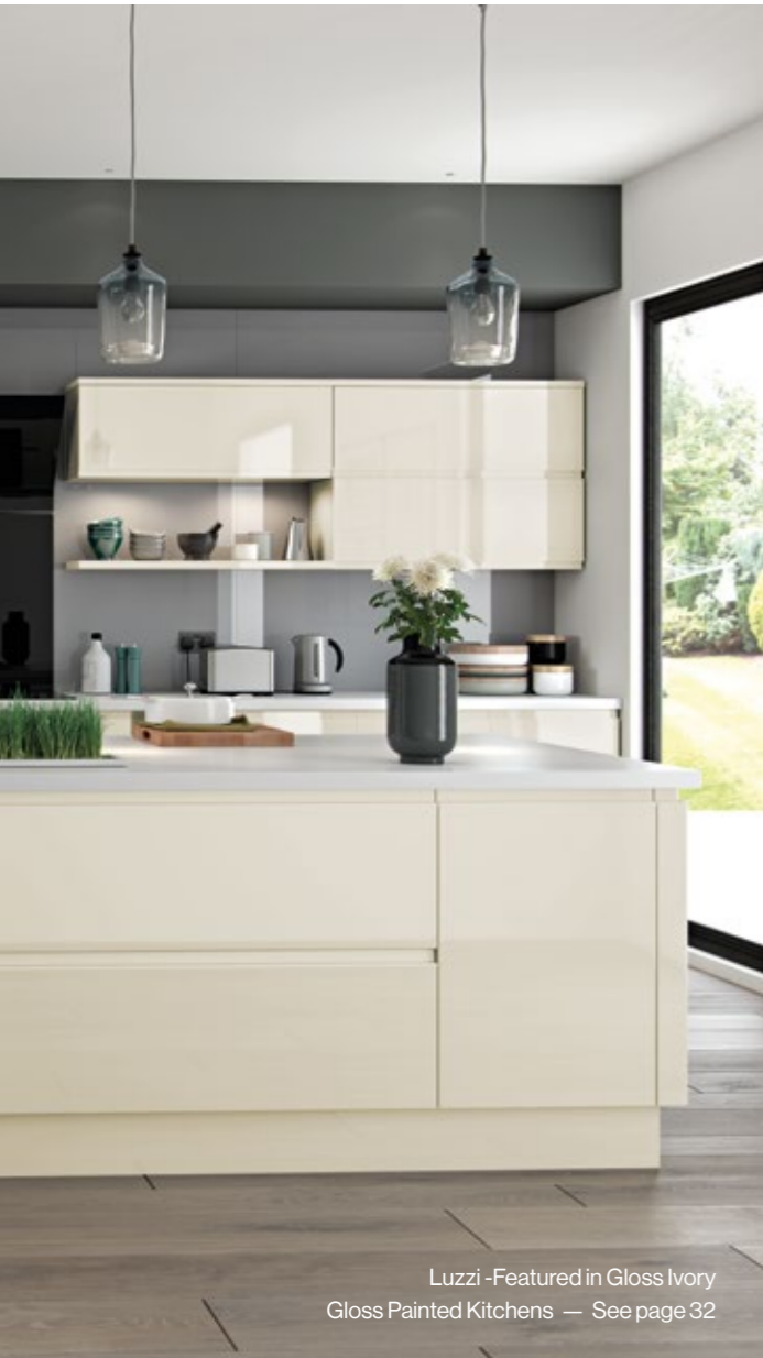
Luzzi - Featured in Gloss Ivory Gloss Painted Kitchens — See page 32