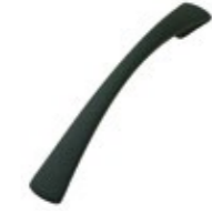
Tapered Bow Black / Code 050