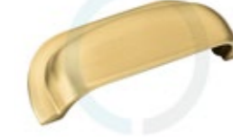
Oxford Cup Brushed Satin Brass / Code 123