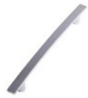
Flat Curve 190mm Chrome / Code 087 (Also available 340mm)