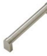
Tubular Boss 204mm Brushed Nickel / Code 064