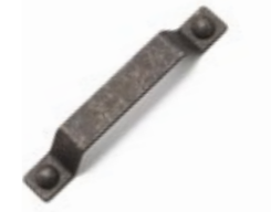
Essen 'D' Handle Pewter / Code 116