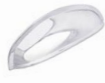
Camden Cup Chrome / Code 098