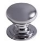
Base Knob Chrome / Code 081