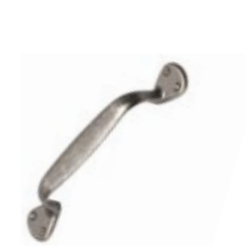
Finsbury 'D' Handle Pewter / Code 119