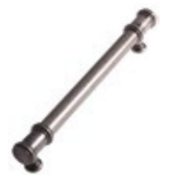
Ornate Bar Pewter / Code 083