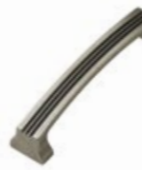
Cromwell Reeded 'D' Pewter / Code 069