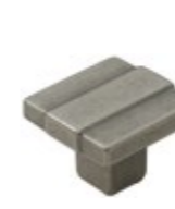
Cromwell Knob Pewter / Code 070