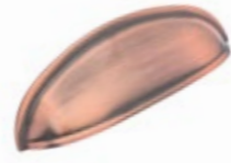
Camden Cup Antique Copper / Code 096