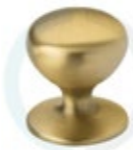
Oxford Knob Brushed Satin Brass / Code 121