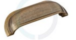
Oxford Cup Bronze / Code 124