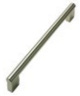
Aries Steel Bar 214mm Brushed Nickel / Code 003 (Also available 502mm)