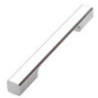
Beam 196mm Chrome / Code 076 (Also available 496mm)