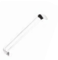
Camden 'D' 168mm Chrome / Code 106