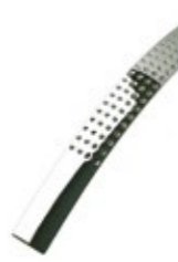
Dimple 'D' Handle Chrome / Code 042