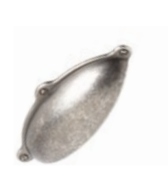
Finsbury Cup Pewter / Code 120