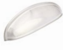
Camden Cup Brushed Nickel / Code 097