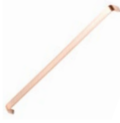
Camden 'D' 328mm Antique Copper / Code 100