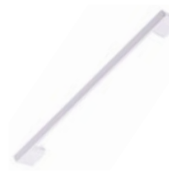
Slim Square 220mm Chrome / Code 117