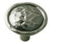
Hammered Knob Pewter / Code 045