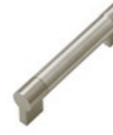
Keyhole Bar 152mm Brushed Nickel / Code 065