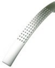
Dimple 'D' Handle Satin Chrome / Code 041