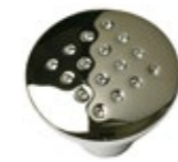
Dimple Knob Chrome / Code 049