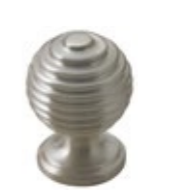
Beehive Knob Satin Chrome / Code 073