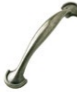
Half-Round Foot 'D' Pewter / Code 031