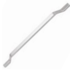
Soho Strap 320mm Brushed Nickel / Code 108