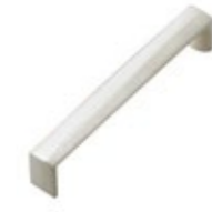
Flat 'D' Handle Brushed Nickel / Code 066