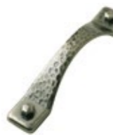
Hammered 'D' Handle Pewter / Code 038