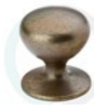
Oxford Knob Bronze / Code 122