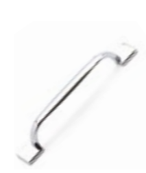
Levi 'D' 128mm Chrome / Code 118