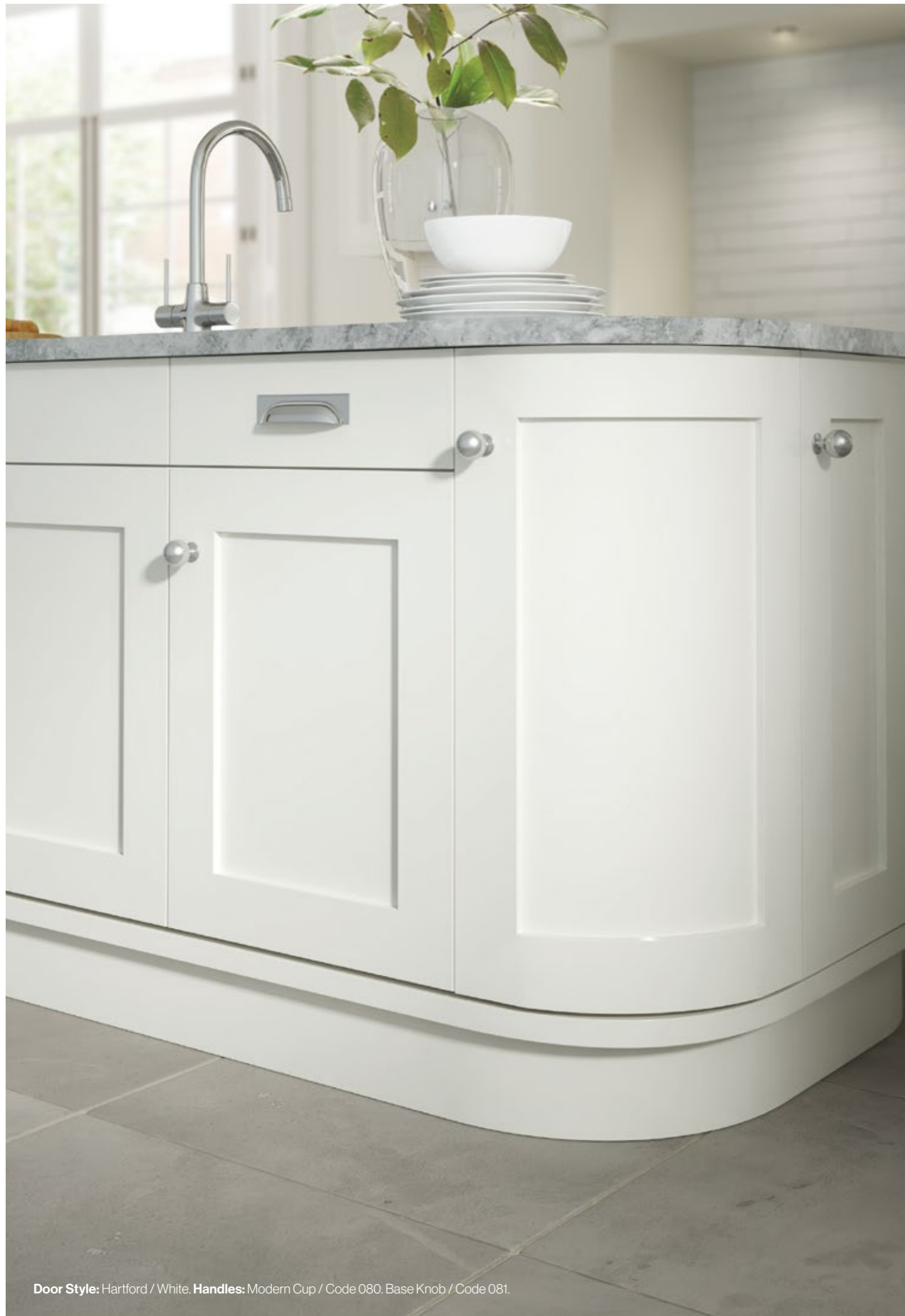
Door Style: Hartford / White. Handles: Modern Cup / Code 080. Base Knob / Code 081.

For a kitchen interior that never fails to impress, choose a timeless finish that suits every door design