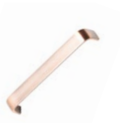
Camden 'D' 168mm Antique Copper / Code 104