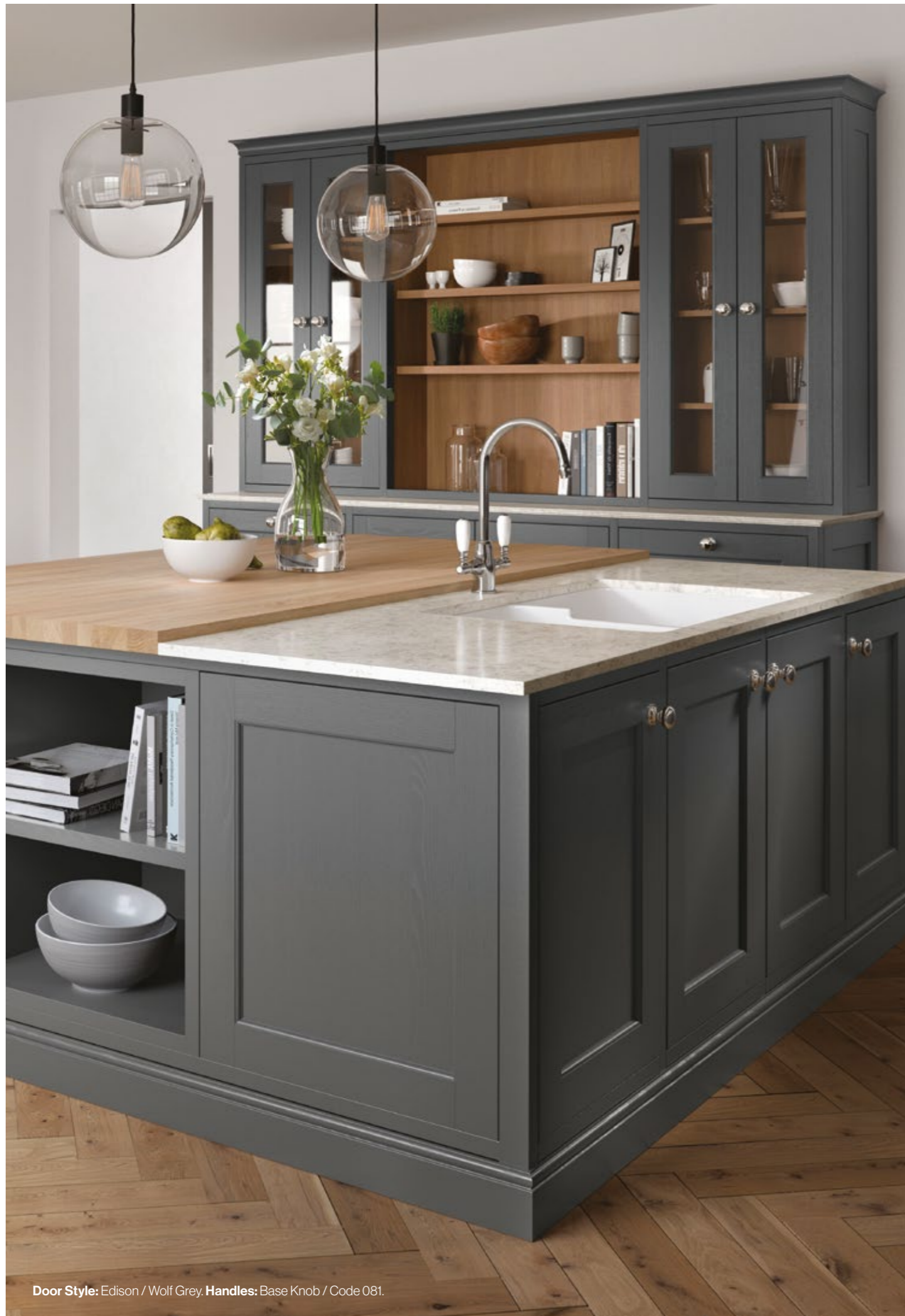
Door Style: Edison / Wolf Grey. Handles: Base Knob / Code 081.

Attention to detail, combined with quality timber and a coat of fresh paint, equals design excellence.