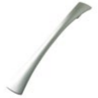
Tapered Bow Satin Chrome / Code 013