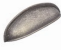
Camden Cup Pewter / Code 099