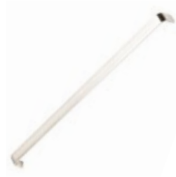
Camden 'D' 328mm Brushed Nickel / Code 101