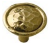
Hammered Knob Bronze / Code 044