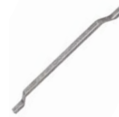
Soho Strap 320mm Pewter / Code 110